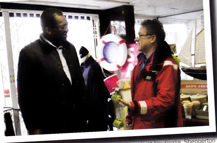
Accessing the flood damage at Nauticalia, Snepperto

Spelthorne's Conservative Council is helping to shape the development of the River Thames scheme.