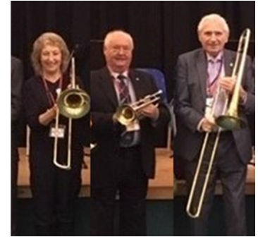
3 of the instruments our grant award helped to finance

If you belong to a local community group and need some help, please do get in touch with us.