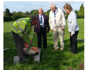
Installation of barrier posts on Duppas Park

We are aware of ongoing enforcement procedures in respect of the stables on Chertsey Road which are giving some residents cause for concern. A planning issue for this is the restriction of openness of the green belt.