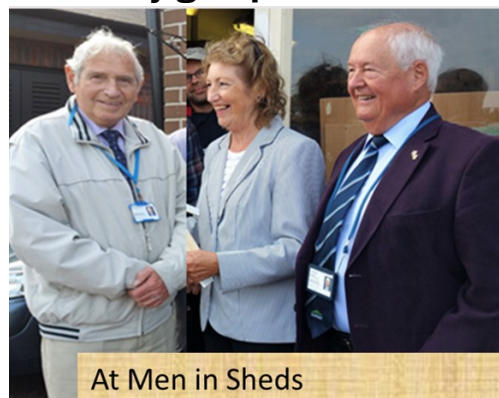
At Men in Sheds

Shepperton Allotments Society for new toilets