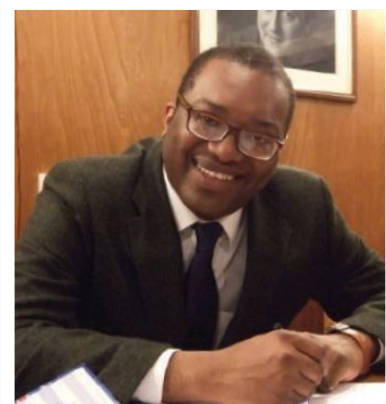
Kwasi Kwarteng MP